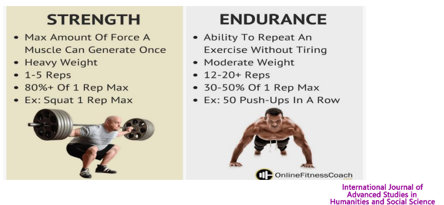
Figure 1. Muscular strength, Endurance workout, Strength and conditioning

transfer chain. It should be noted that increasing the concentration of the enzyme is proportional to its activity [23-25]. As a result, increasing the volume of mitochondria increases the ability of a skeletal muscle to maximize oxygen consumption. Endurance training increases plasma volume and thus blood volume, thereby increasing blood flow back to the heart, and increasing end-diastolic volume [26-28]. This effect will increase the contractile force of the heart during cardiac systole due to the Frank-Starling law of the heart and due to the stretching of the muscle fibers of the ventricular wall and the reaching of the sarcomeres to their normal length (2.2 µm) [29-31]. Endurance exercise causes the ventricular cavities of the heart to become larger and the free walls of the ventricles to increase proportionally [32-34]. Because with the increase in blood volume and the return of venous blood, the number of cardiac arrests increases, due to the increase in the volume of the diastolic end of the ventricles. As the heart works harder, it will become hypertrophic and expand in its ventricular cavities (Figure 2) [35-37].