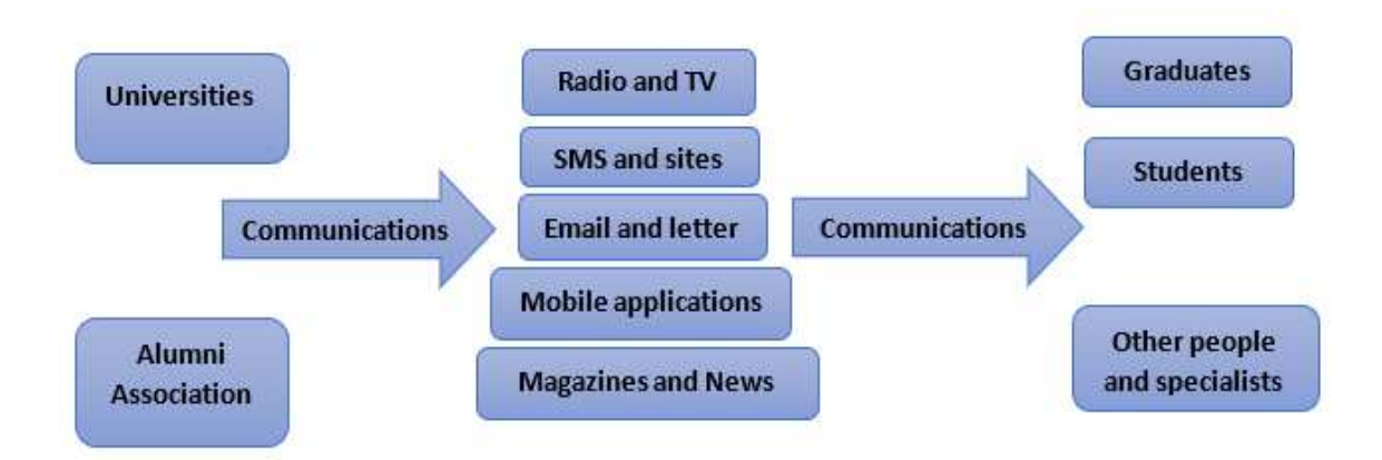
Figure 2. Innovation in the relationship between graduates and the university